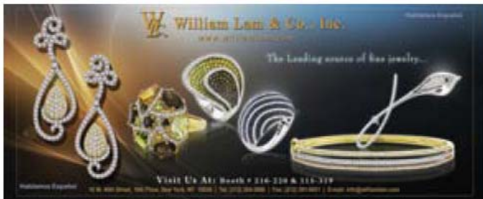
EXAMPLE OF FULL PANEL

GRAPHIC SPECIFICATIONS: Graphics are to be sent in high resolution EPS, JPG or TIFF files. No GIF or BMP files please!